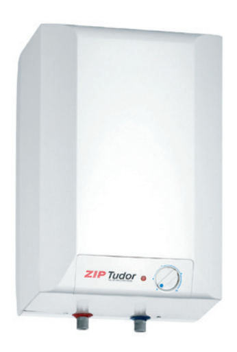
Zip Tudor 10Lt over sink model

Over sink or under sink Water Heaters 5 litre, 10 litre open outlet to single point